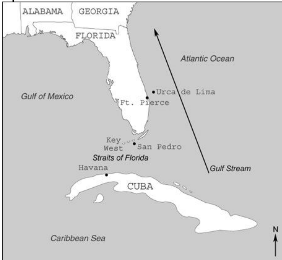
Map 2: The Urca de Lima and the San Pedro wreck sites

Because of the Gulf Stream and the limitations of primitive navigation techniques, the treasure fleets followed the Straits of Florida—the channel between the Florida Keys, Cuba, and the Bahamas connecting the Gulf of Mexico with the Atlantic—on their way back to Spain. Treacherous reefs and shoals made this the most dangerous part of the journey. Although general weather conditions were better during the summer, the warm waters of the Atlantic could help produce strong storms called hurricanes.